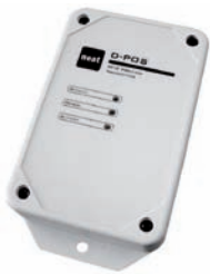
D-POS Position Transmitter

This flexible and unrestricted monitoring solution helps to provide both independence and a secure environment for vulnerable users as they move unrestricted throughout a property.