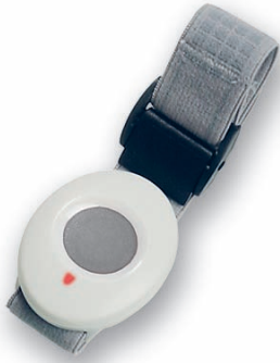
D-Atom Portable Trigger